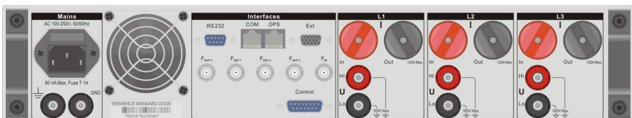
Rear panel of RS 2330