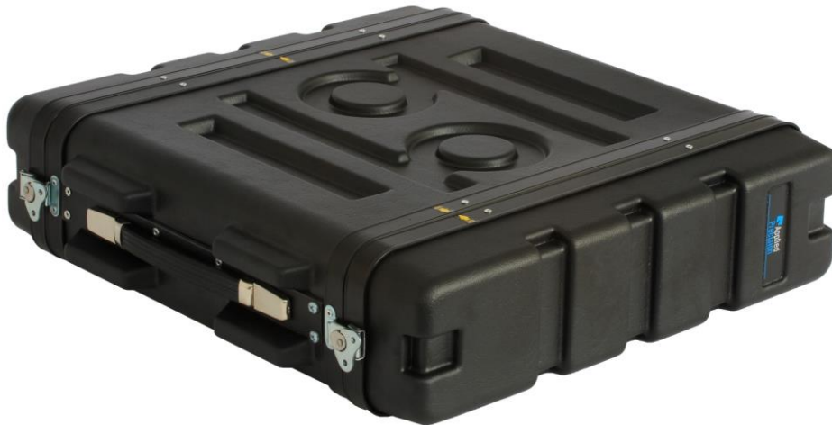
Transport Case RSTC 1000