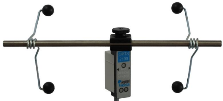
Optical Sensor OPTS 2100 with its Fixing Clamp OPFC 1000