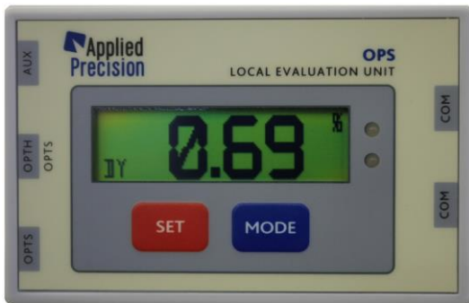
Error Calculator OPS

* Standard accessories defined for devices sold apart of Power Source