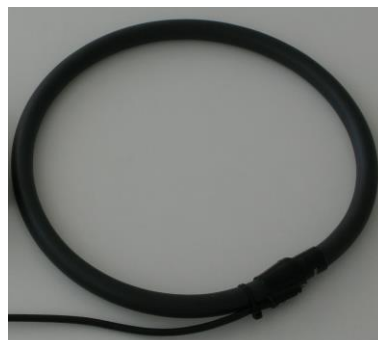
Flexible Current Probe 6000 A FCP 3x21